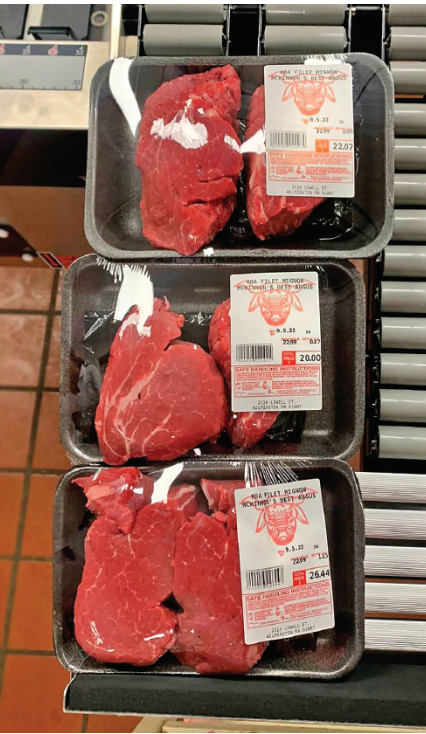
The automatic wrapper provides productivity and a beautiful finish

Ed discussed the features of the machine with DIGI America Sales Rep. Lynn Orsi. Considering the increase in productivity compared to the hand wrapper, Ed Penta stated it was a "no-brainer" to immediately replace the hand wrapper with the new auto-wrapper. Output has increased 75% by wrapping 36 trays per minute, resulting in keeping up with the high-volume. Plus, Ed mentioned it always provides a consistent clean product with accurate label placement.