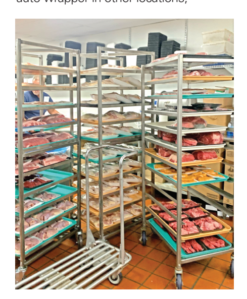
AW-5600ATII supports high-volume output in the meat department

Previously, the meat department at the new location used a hand wrapper for all its orders, averaging 11-13 trays per minute. Scott Conrad, McKinnon's Wilmington Store Manager mentioned, "At minimum, 1,000 packages per day, so 7,500-10,000 units per week is a very fair estimate." Unable to keep up with demand, sales were taking a hit. Knowing the positive outcome of the auto-wrapper in other locations,